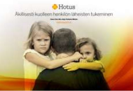
Supporting relatives and other close ones of a person who dies suddenly

a host organization of two collaborating centers: same target as the NRF